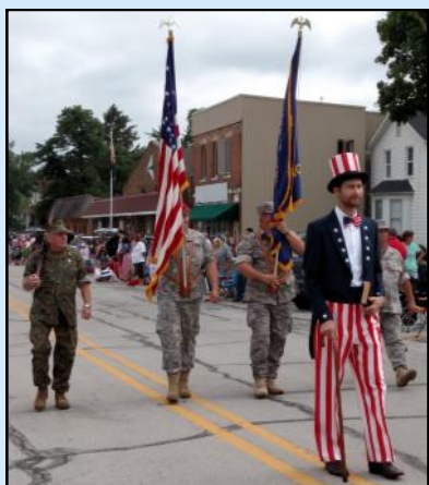
Uncle Sam and the Amvet Color Guard

The Commission signed a new three year contract with A+A Amusements of Fairbury, Illinois, and there is one year left on the fireworks contract with Melrose Pyrotechnics. The Commission is already working on entertainment for next year. The carnival may also be moving back to the grass portions of the park next year if the grounds are dry. This will free up some more parking including the handicapped spaces and also reduce the amount of damage done to the fire district parking lot. The celebration will also be running for five days next year, since the Fourth falls on a Tuesday. The Commission thanks all of the volunteers who donate their time to make the festival a success and those of you who come out and support the festival!