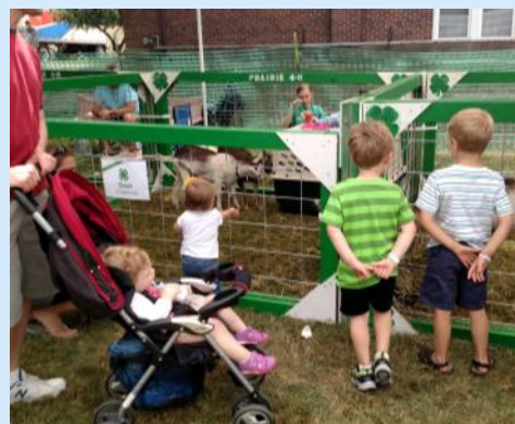
Families enjoying the animals at the 4-H Expo

The Fourth of July Commission is accepting applications for Commissioners. The Commissioners are expected to attend approximately one meeting per month throughout the year and are expected to be present during most of the hours each of the 4-5 days the fest is open in addition to park preparation for up to two weeks before the festival. For an application go to the Village's website at www.villageofbeecheer.org .