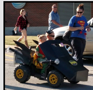
Kiddie & Pet Parade 2017

7-7:50 am - Lions Club 5K Run/Walk Registration 8:15 am - Lions Club 5K Run/Walk begins 12 pm - Carnival, car stand and Festival Market open (all other stands open after parade) Noon-3 pm - $20 wrist bands 2-3:30 pm - Parade line-up and registration 3 pm - Float judging 4 pm - Parade 6-9 pm - Bingo 7:30-11 pm - Kingfish on main stage 9:30 pm - Fireworks 11 pm - Car drawing