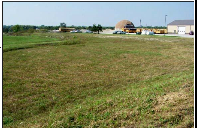
This is the proposed future site of the new public works facility located on the north side of Indiana Avenue next to Washington Township Center. Located in the background is the salt storage dome and the fuel depot shared by all Beecher taxing bodies.

In short, the Village can provide a larger facility for the public works department, use the existing building as part of the sewer treatment process in the future, and accomplish all this without raising Village residents' taxes. Whether or not you agree with this proposal, you are encouraged to vote on this referendum which will occur during the general election on November 4 th .