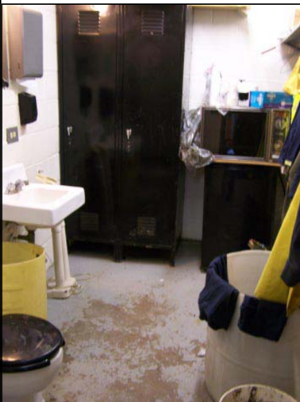
This is the washroom at the current public works garage which also doubles as a kitchen.

The existing garage will not be torn down, but will be converted to a sludge drying facility when the sewer treatment plant is expanded. This facility is being required by the IEPA to remove phosphorus from the waste when the plant is expanded in the near future. The re-use of this building will result in a cost savings of over $500,000 when the plant is upgraded. Until that time, the building will be used for cold storage.