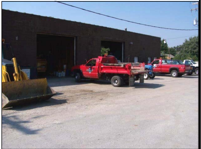
Space at the Public Works garage is extremely limited. Eight employees share the space which is located next to the sewer plant.