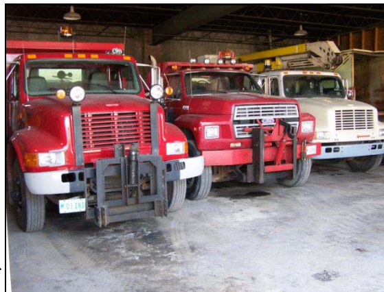
This is an example of the cramped quarters at the public works garage at 380 Ahrens Drive. The garage is located next to the sewer plant.

For the past two years, the Village Board has made plans to expand its facilities but with the guideline that an expansion would not increase the cost to existing residents. A 3.5 acre parcel of land was purchased for $50,000 at Indiana Avenue and Town Center Road in front of the Township's building for this purpose. It was then decided that a new public works building could be built using the re-authorization of General Obligation Bonds which mature in 2009. If the voters approve a