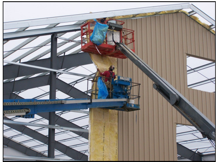
Workers put up insulation on one of the walls

The construction of the new Beecher Public Works facility, located at 30300 Town Center Road, or at the corner of Indiana Avenue and Cardinal Creek Boulevard, is progressing on schedule. The walls and roof were installed in the last week, and the next step is to pour the cement floor inside the building and add the heating plant and fire protection systems. The Public Works Department has decided to complete its relocation from 380 Ahrens Drive (the sewer plant) to the new building over the course of the Winter, so tool racks and materials storage can be thoughtfully laid out. In the Spring of 2010 when the move is complete, an open house is planned