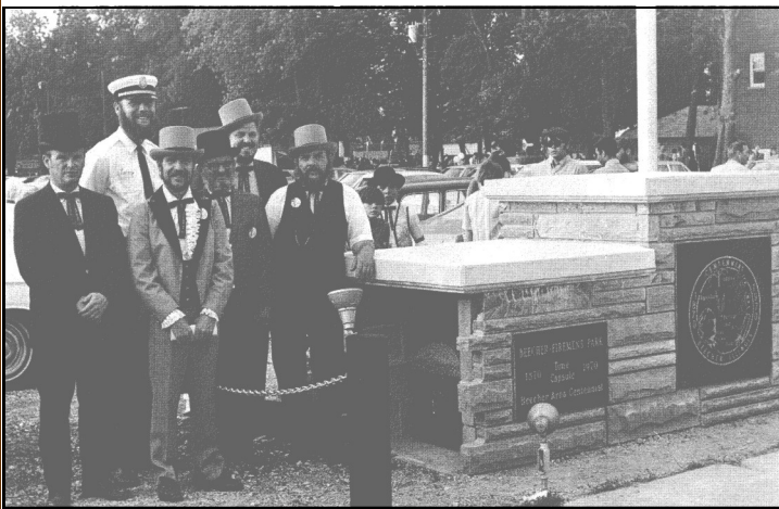
Centennial Memorial when originally dedicated in 1970

This was not an easy project. The time capsule, which was still intact, had to be removed by a backhoe and stored over the winter since it was encased in a heavy cast-iron vault. Damaged granite had to be replaced with similar material to match the existing pieces which could be re-used in the project. Weather also delayed the project until the Spring of 2012. However, the end result is a virtual replica of the 1970 memorial which should last for another 58 years when the time capsule will be removed and displayed for the enjoyment of future generations of Beecher residents.