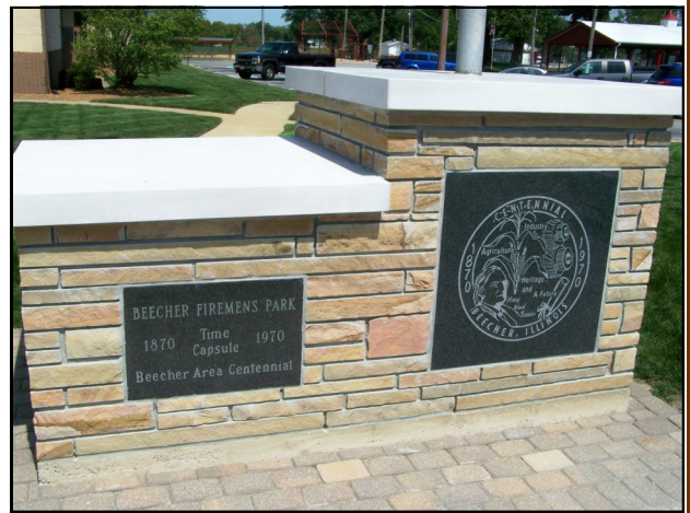
Newly renovated Centennial Memorial