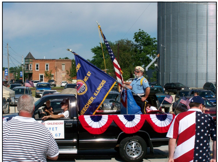
Beecher Amvets float in the 2008 Fourth of July Parade