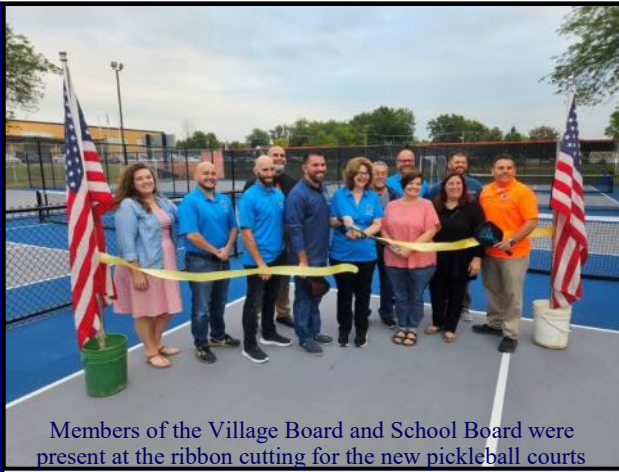
Members of the Village Board and School Board were present at the ribbon cutting for the new pickleball courts