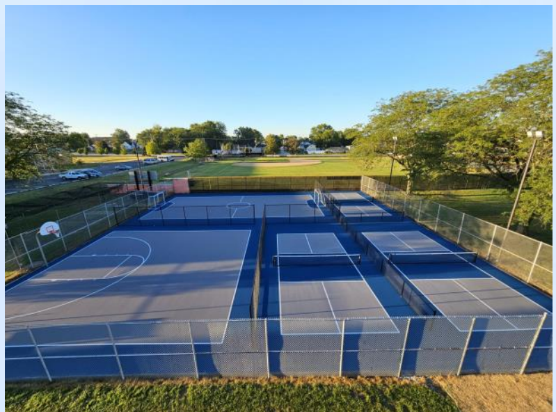
Pickleball Courts by High School