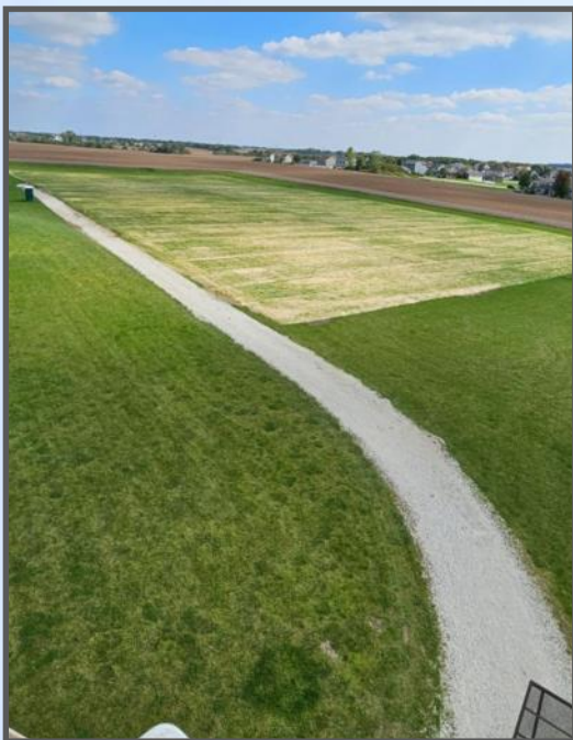
Welton Stedt Park (by Jr. High)

An additional $80,000 was provided by Fieldgate, LLC to improve Welton Stedt Park so the remaining $256,600 will be used for watermain replacement, more specifically to replace the old mains that cross and parallel Dixie Highway.